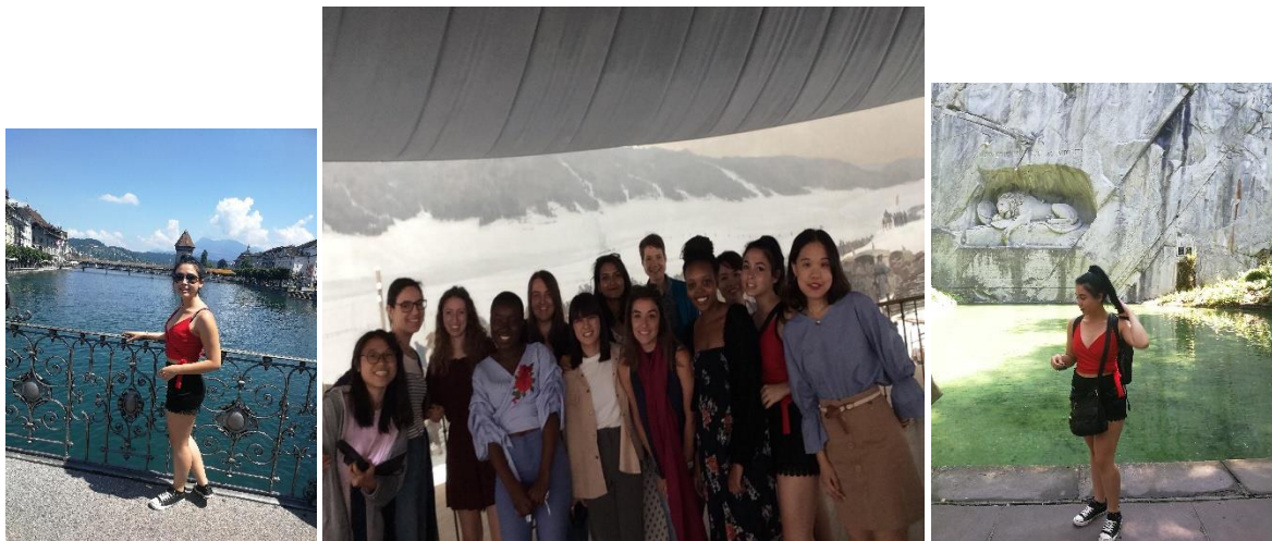
Academic trip to Lucerne: Bourbaki Panorama and other historical sites