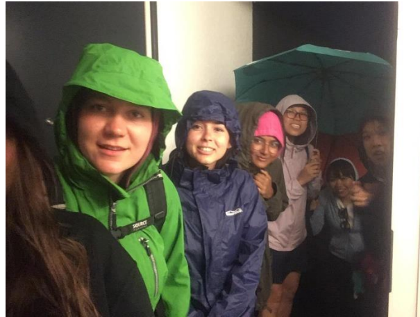
Getting caught in the rain on the way to the bus stop while visiting a friend.

In preparation for my journey, I made sure to pack warm clothes, as I thought: no way it would be as hot as South Africa. To my surprise I did not need my warm clothes at all, they just came with for a little trip! I was surprised by the humidity. I would definitely say the weather in Switzerland is very much like Durban, as it is hot and humid and the next moment it is raining. This kept things interesting!