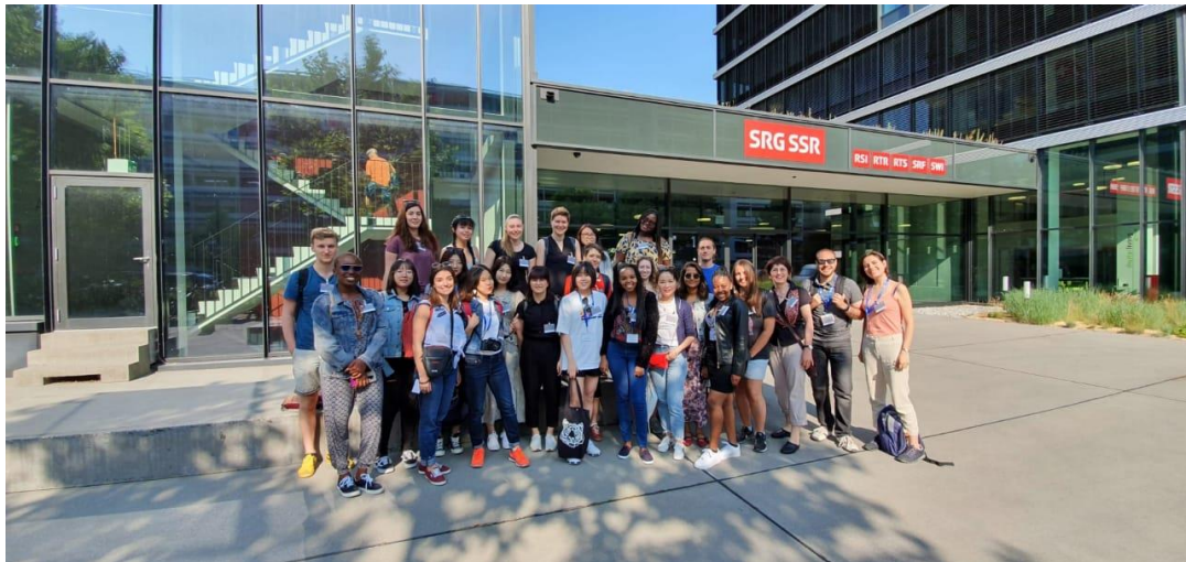
Swiss info , academic trip: Lecture on intercultural competence in the work place