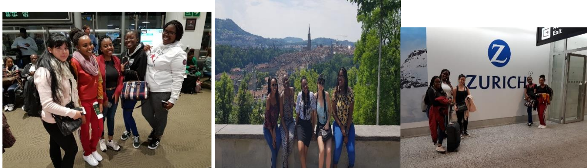
The five ladies I got to experience this amazing opportunity with.

During the June - July holidays five students from the University of Johannesburg embarked on a journey to Switzerland to attend a three week summer school at the University of Zurich.