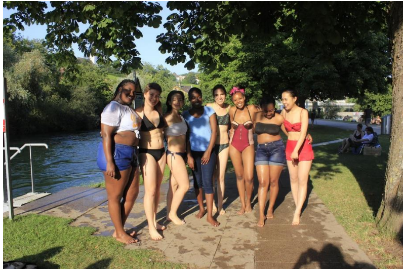
Meeting new people and making memories!