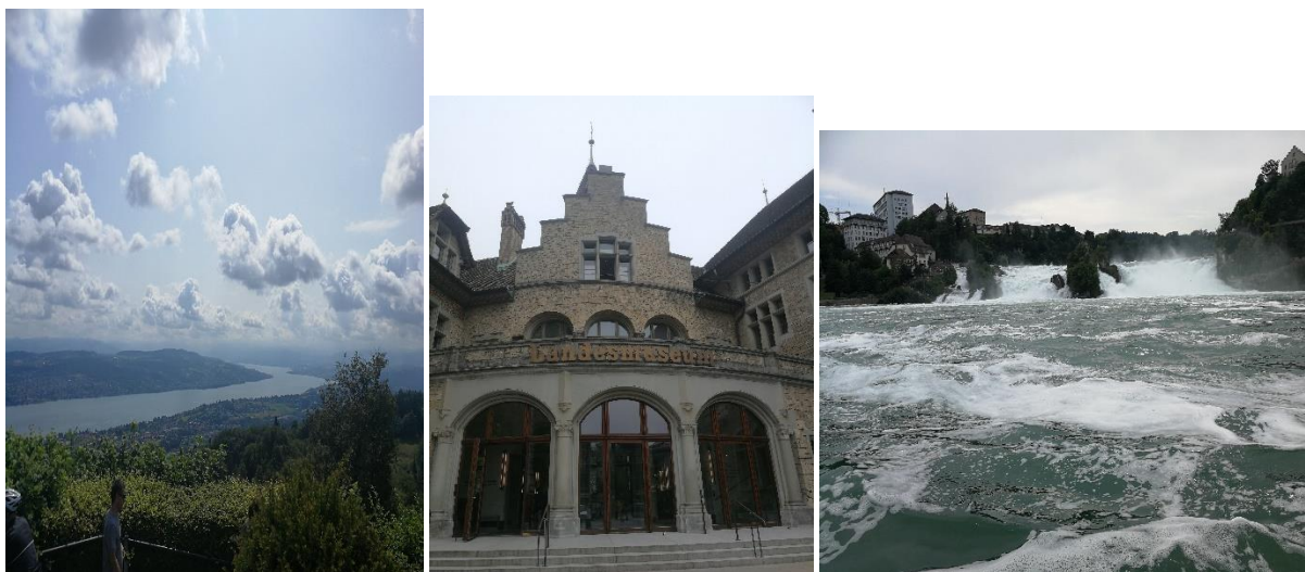
Hike up Uetliberg mountain, historical museum and the Rhine falls in Schaffhausen