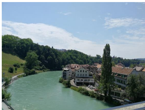
Bern: Old town

The summer school focused on linguistics, misunderstandings and mis communications and what to do in the case of conflict. Instead of being trapped in a classroom, we took many academic trips to places such as Swiss info (a Swiss news forecasting forum), Bern, Lucerne and historical museums. We also took part in many social programs such as cheese fondue, hiking, boat rides and a tour to the Rhine falls.