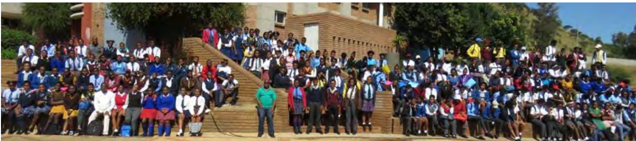
Pictured above: Learners and parents from SSC's 2019 Intervention Program, which commenced with first quarter holiday classes