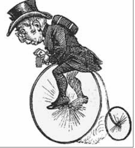
So can a big wheel and a little wheel...