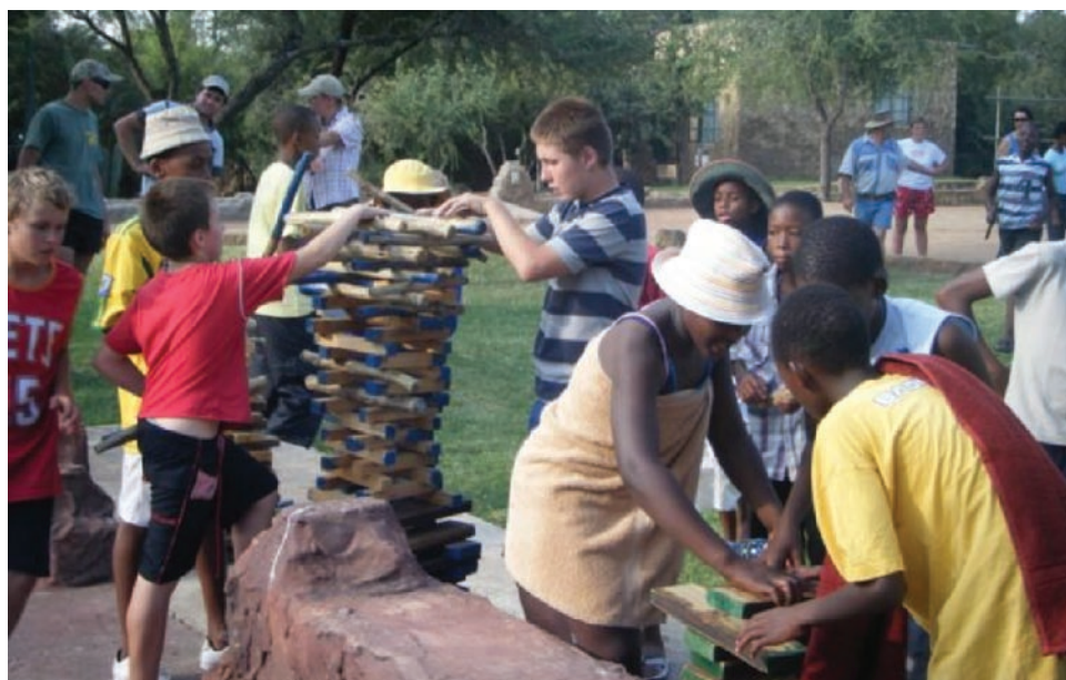
Elandspark School excursion.

For many of the learners this outing was their first experience of camping.