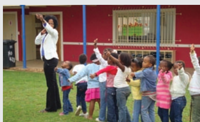
Children in outside activity with their teachers

The Faculty of Education at the UJ started a new Institute on the Soweto campus at the beginning of 2010. This is part of our brief to contribute to innovation in school education. The UJ's hybrid of a 'charter school' is the Funda UJabule School, a foundation phase school on the Soweto campus. This is a public school in the Gauteng Department of Education system – the school serves more than the purpose of educating young children, it is an inherent part of the Institute and integrates various functions of training, research, and service.