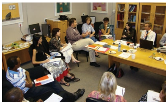
The Editors in discussion