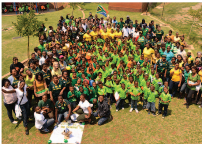
Foundation phase teachers host "Bokkie Day" as part of their service learning with Funda UJabule school children

As part of their teacher education programme, first year B Ed Foundation phase students are introduced to the pedagogy of service learning. The aim is to train them to provide services that meet the needs of a community.