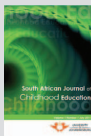
Covers for the two CEPR journals: Education as Change and South African Journal of Childhood Education