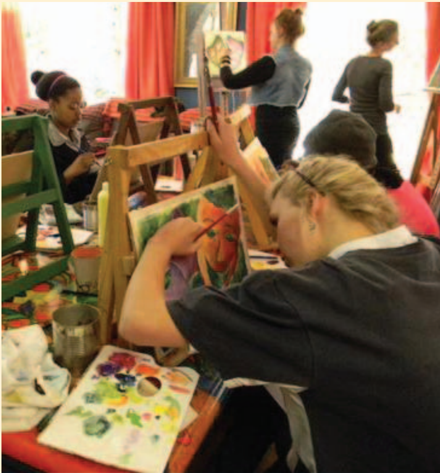
First year students taking part in a visual arts workshop

Arts and Culture is an exciting and rewarding subject which covers many aspects such as dance, drama, music and art. This subject explores a myriad of possibilities for both the educator and the learner.