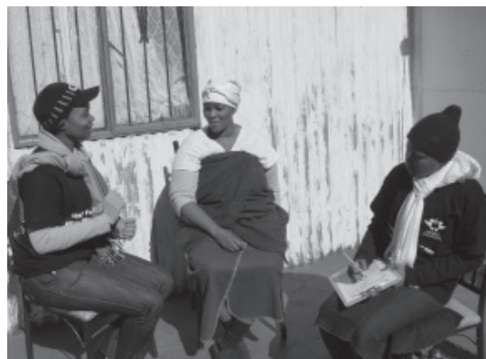
CSDA fieldworkers conducting an interview in Doornkop, Soweto.