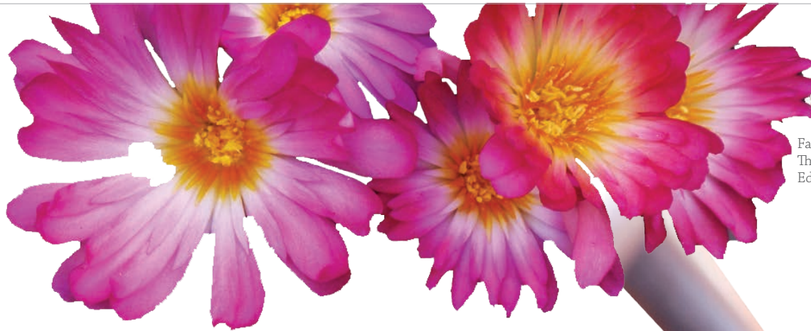
Fairy Elephant's Foot ( Frithia pulchra ) The signature plant of the Childhood Education Flagship