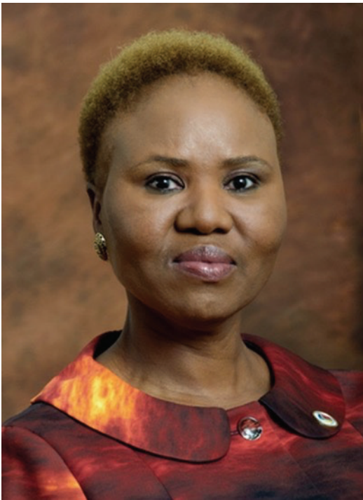
The Hon Minister Ms Lindiwe Daphney Zulu

Minister of Social Development Republic of South Africa