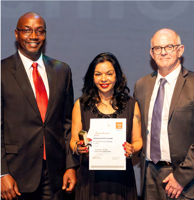
Photo 7: Prof. Shikha Vyas-Doorgapersad – CBE 2024 – Prestigious Research Awards Ceremony.