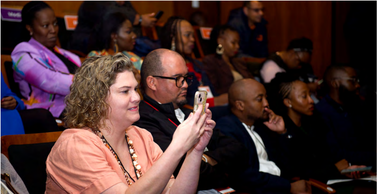
Guests at Hon. Shipokosa Paulus Mashatile's distinguished guest lecture.