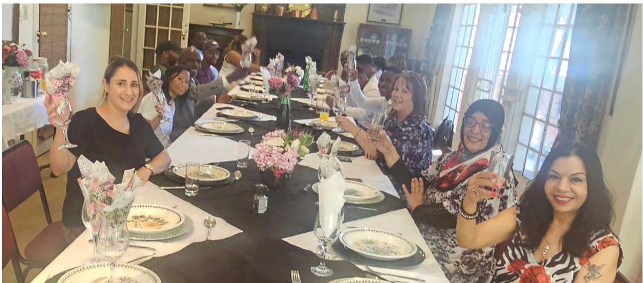
SPMGPP staff members at the End of Year Function on 28 November 2024.

Here are some of our precious staff members at the function: