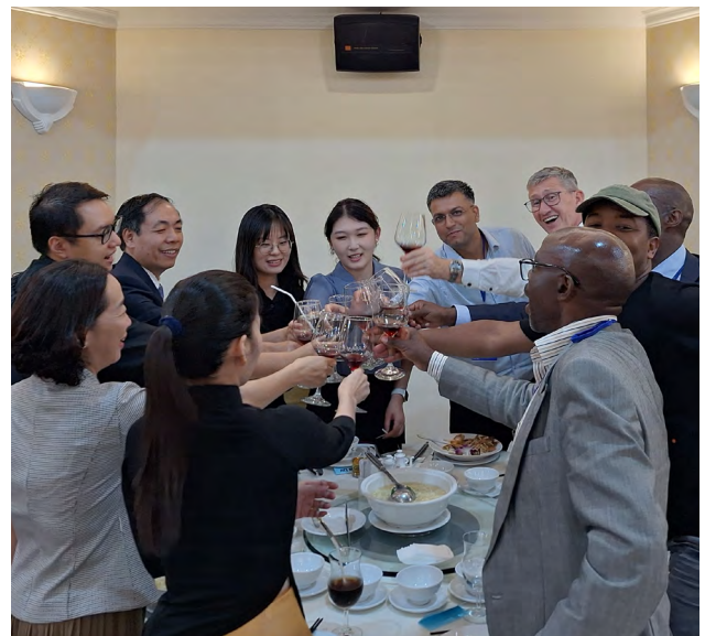
SPMGPP staff members and international delegates raising a glass to each's success at the Kimdo Royal Hotel after a successful conference in Hu Chi Mihn City (Saigon), Vietnam-2024.