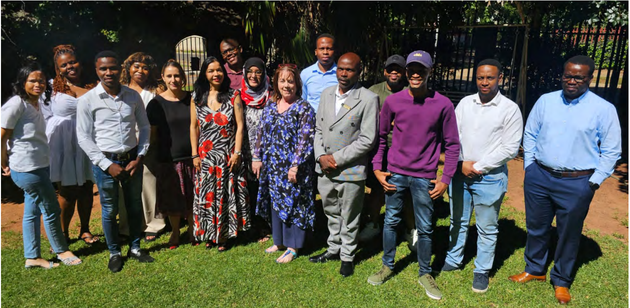
SPMGPP staff members at the End of Year Function on 28 November.