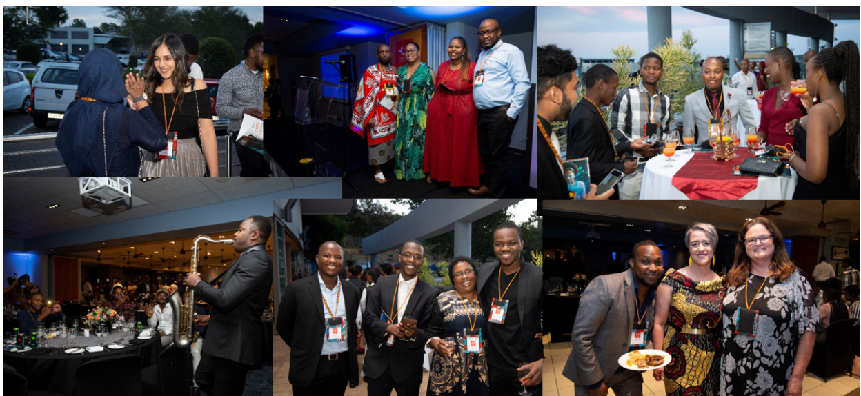
AIS staff and AIS alumni

On 7 November 2019, AIS hosted a beautiful alumni gala dinner at the School of Tourism and Hospitality. The event was well-attended, and was filled with inspiring speakers, great entertainment, and socialising and networking among the alumni and AIS staff.