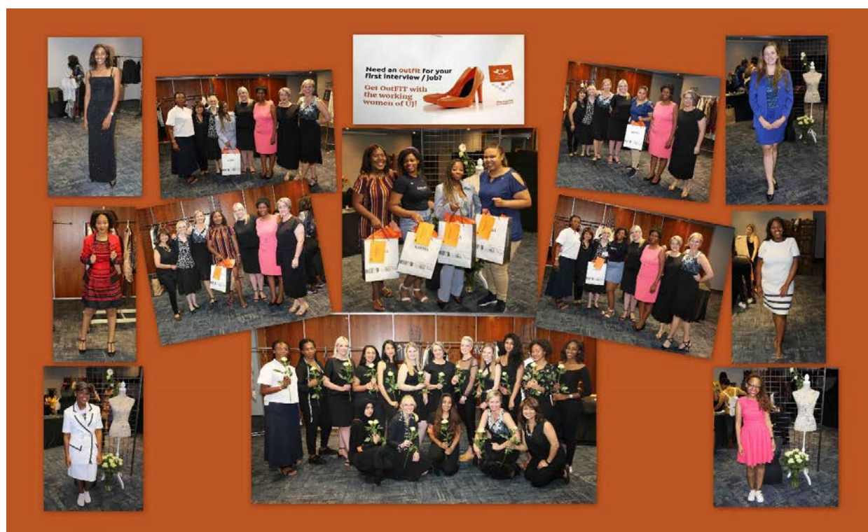
Female graduates and the UJ staff team

On 15 November 2019, a project was launched to gift females graduating soon with an 'Outfit' so that they are "fit" for the working world, but specifically for that first job interview. Those donating the outfit, were also asked to attach a note with encouraging words to this outfit, to inspire future woman leaders. As a pilot, a few departments' third year and fourth year students were