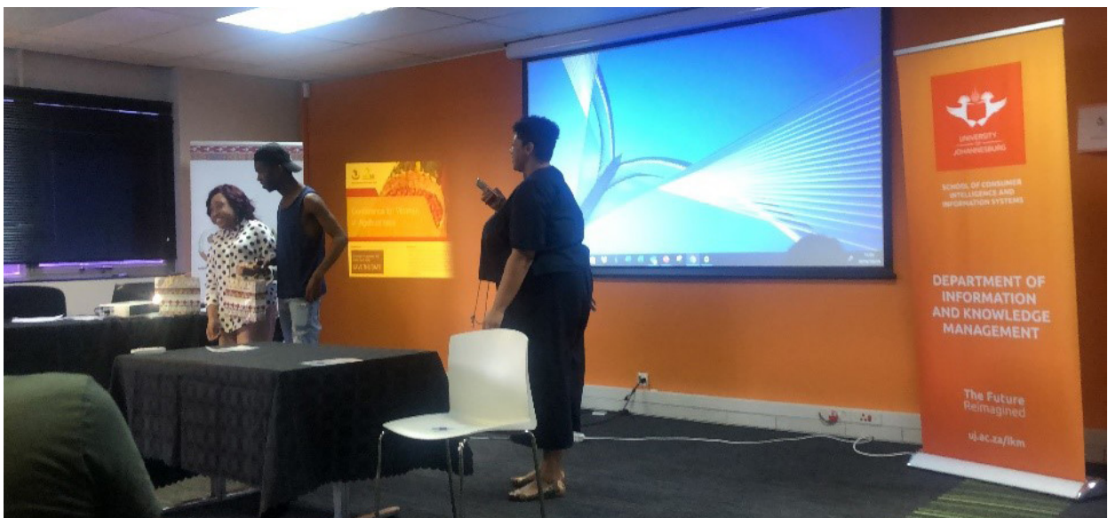
IKM students and AUDA-NEPAD staff

On 24 October 2019, IKM Honours and 2nd year students were invited to visit the African Union