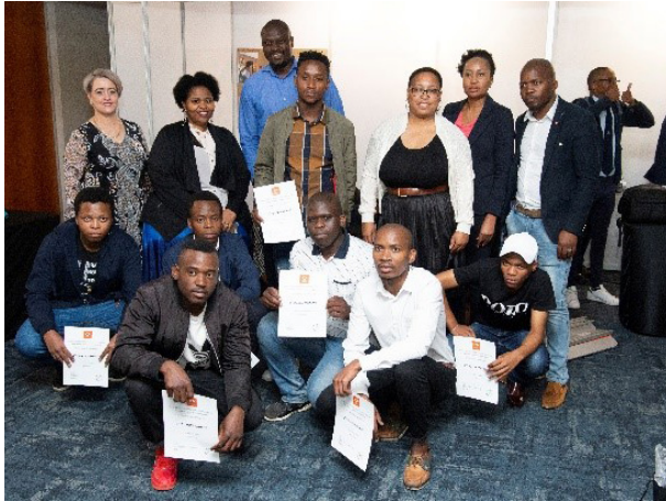
Diploma IT students and Advanced Diploma IT students

The students' IT Project Day displayed a collection of IT-related projects, including software applications and business analysis presentations. These projects are a