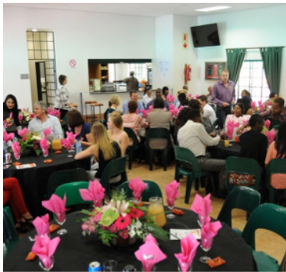
The Top Achievers, their parents and Department staff at the function