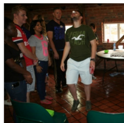
BCom Marketing Management (Honours) students in action on the day