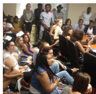
Students carefully listening to the brief presented by Clearwater management