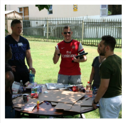
BCom Marketing Management (Honours) students in action on the day