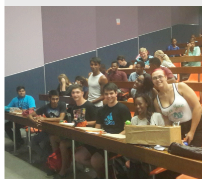
First-year BCom Marketing Management students – Winners of the treasure hunt

Once all the administration was out of the way, it was time for the fun to begin. The session kicked off with THE APPRENTICE and the challenge was "How to GREEN outside the box?". Students were divided into smaller teams and each team was handed an empty cardboard box. Students were requested beforehand to bring along at least 5 recyclable items. Using the box and the recyclable items they had brought along, teams were challenged to design an advertisement/display for a company of their choice. It could have been anything – from a billboard, to an exhibition stand to a television advertisement! They could compile anything they could think of with their own creativity being the only challenge.