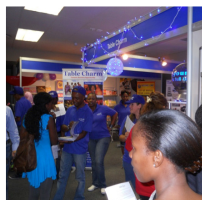
Students at the DSA expo

Students were divided into groups consisting of a combination of the various disciplines allowing group members to contribute to a specific area of the strategy. On the 20th of February, the students went to visit Clearwater Mall where they met with the management team of the mall who briefed them on the mall's target market and its strategy. In addition, the students were informed regarding the tenant requirements and typical cost of renting a shop within the mall so that the groups can come up with realistic budgets for their stores.