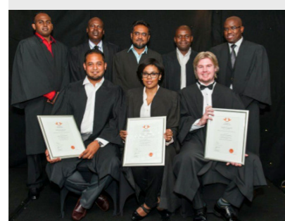
The Pick n Pay Academy Graduates