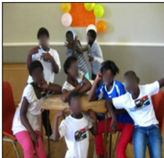
Figures 2 and 3: A cabinet of youth health advisors deliberates on the objectives of the AYHP (2014). Here, the appointed minister consults her cabinet on their experiences of health services. [Faces blurred to protect participant confidentiality]