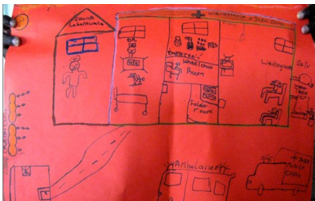
Figure 4: 'Dream Clinic'. Notable features –an ambulance and a mobile clinic, a wheel chair room, a water tank, a comfortable waiting room with access to digital entertainment