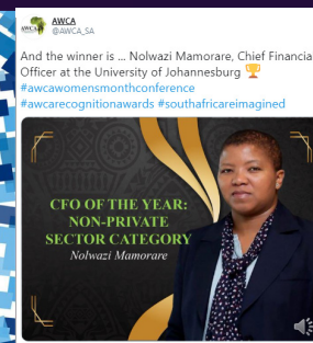
11:42 AM - Aug 8, 2020 - Twitter for iPhone