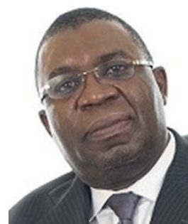
Dr Sydney Mufamadi