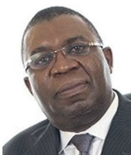
Dr Sydney Mufamadi Director: Centre for Public Policy and African Studies

Previously known as the School of Leadership, the Centre for Public Policy and African Studies is a hub of teaching and learning targeted at recruiting public-spirited students who are involved or aspire to be involved in policymaking, policy implementation or policy research. The Centre offers two Continuous Education Programmes (CEP) namely, Research Awareness for Leaders and Public Policy and African Studies. These serve as a bridging programme towards a Postgraduate Diploma in Public Policy and African Studies (PGDip). The programmes consist of a compulsory research module (Research Practice for Leaders) and three elective modules (Industrial Policy, Strategic Diplomacy and Transitional Justice). Lectures are offered via blended learning and ongoing online interaction with students. All registered students, apart from four Zimbabwean parliamentarians, concluded their academic year studies in 2020.