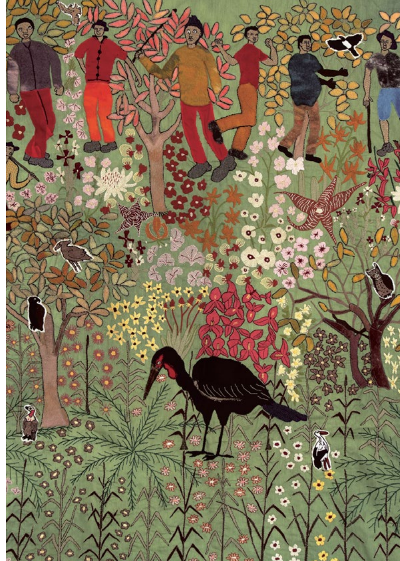
Image: Intsikizi Tapestries by The Keiskamma Art Project

The DSD DESIS Lab meets monthly to interrogate research, projects, methods and products that impact on the intersection and interplay between design, society and development in our specific context. We understand design as referring to the conscious choices we make in creating systems (community, society and productive systems) and technologies (products, artefacts, communicative technologies, systems integration); society as the human context that includes the broader social systems of culture, economy, politics and environment; and development as the discourse and practice of positive and considered change. We draw on critical political economy, social sciences, appropriate technology development, participatory and human-centered design, and other design approaches in our practice and research. For more info please visit http://www.designsocietydevelopment.org/