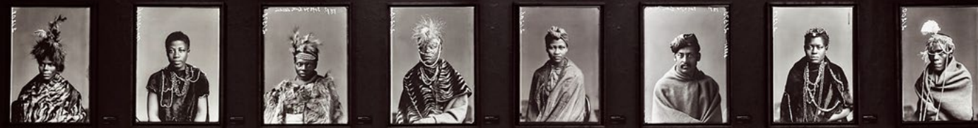
The African Choir 1891 Re-imagined. Installation view from the exhibition Black Chronicles IV (Curated by Renée Mussai of Autograph ABP, London), FADA Gallery, April-May 2018.

www.instagram.com/viad_fada • www.viad.co.za