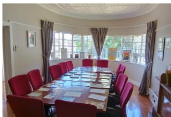
EXHIBITING CERT-CAWE'S WORK (14/03)