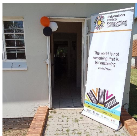
CERT-CAWE WITH WIDE OPEN DOORS! (14/03)