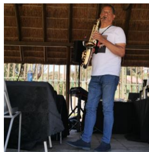
GORDON JACKSON PERFORMING (14/03)