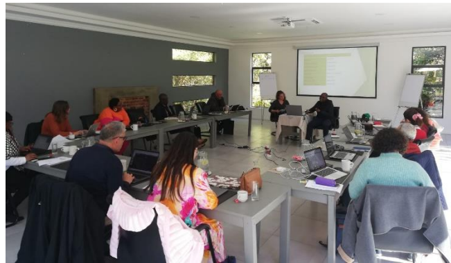
DISCUSSING STUDENTS' PRESENTATIONS (24/05)