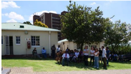
A WELL-ATTENDED GATHERING (14/03)