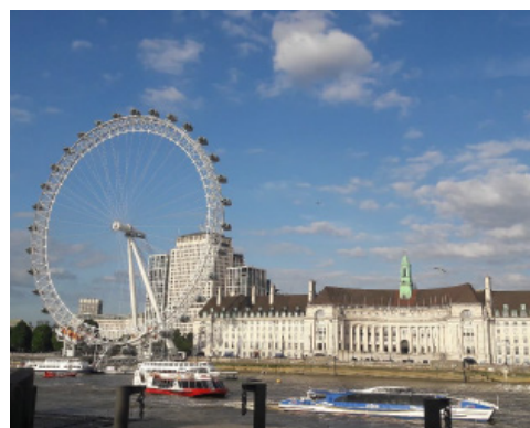
Three UJ students attended a three week Summer School programme (30th June to 22nd July) at King's College, London.