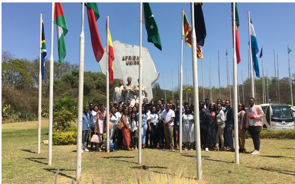
A group of 60 UJ students participated in the Africa By Bus programme and visited Zambia in September.