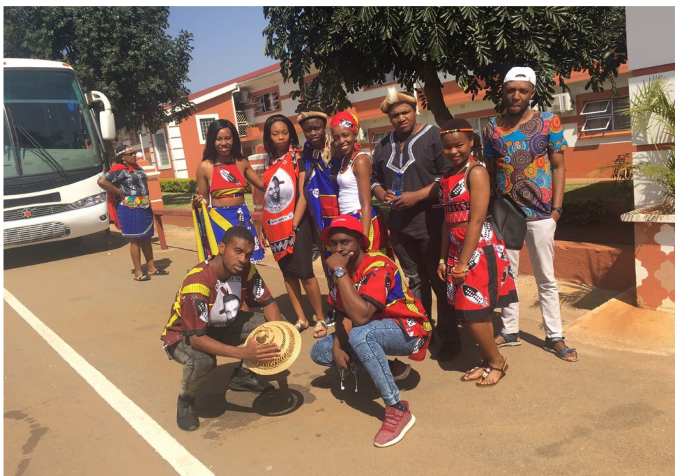
A group of 60 UJ students participated in the Africa By Bus programme and visited Swaziland in August.