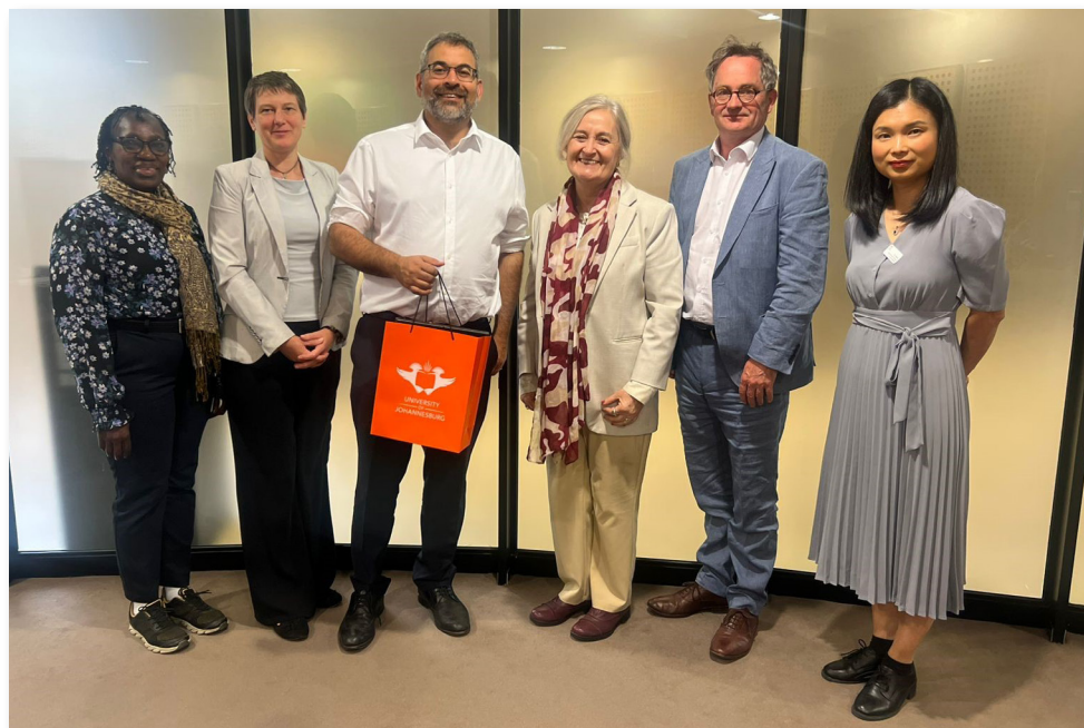
Visit of University of Sussex, UK