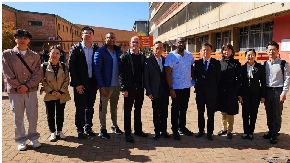
Visit of Shanghai Medical College, Fudan University