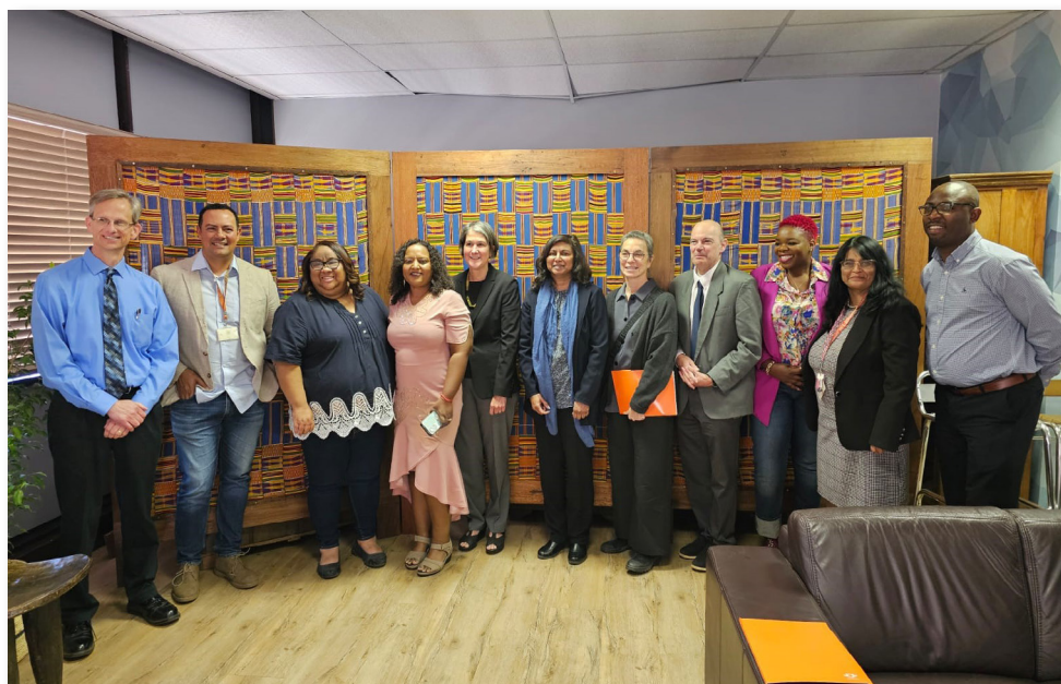
Visit of University of Iowa, USA