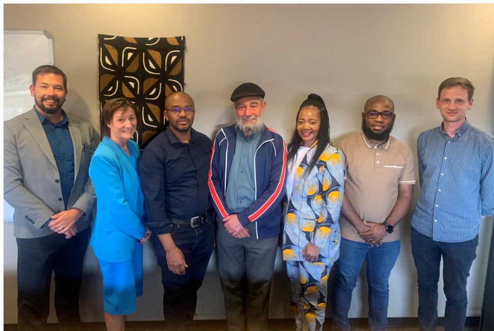
Visit of University College Dublin