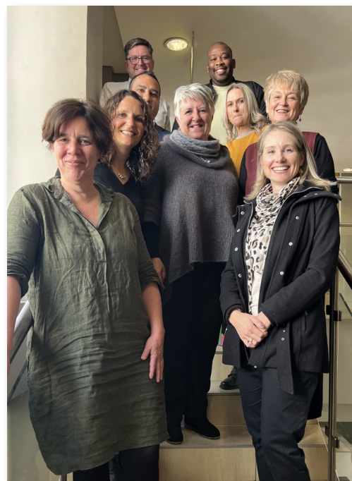
Visit of Furtwangen University, Germany