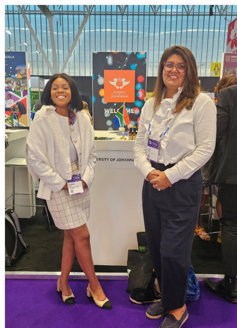
EAIE Conference and Exhibition, Toulouse - France