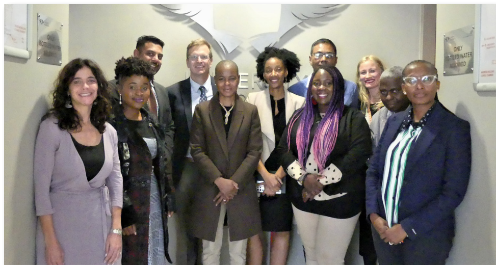
Carnegie Mellon University Africa visit