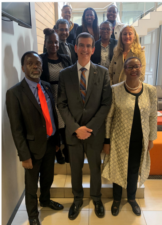
US Consul General visit