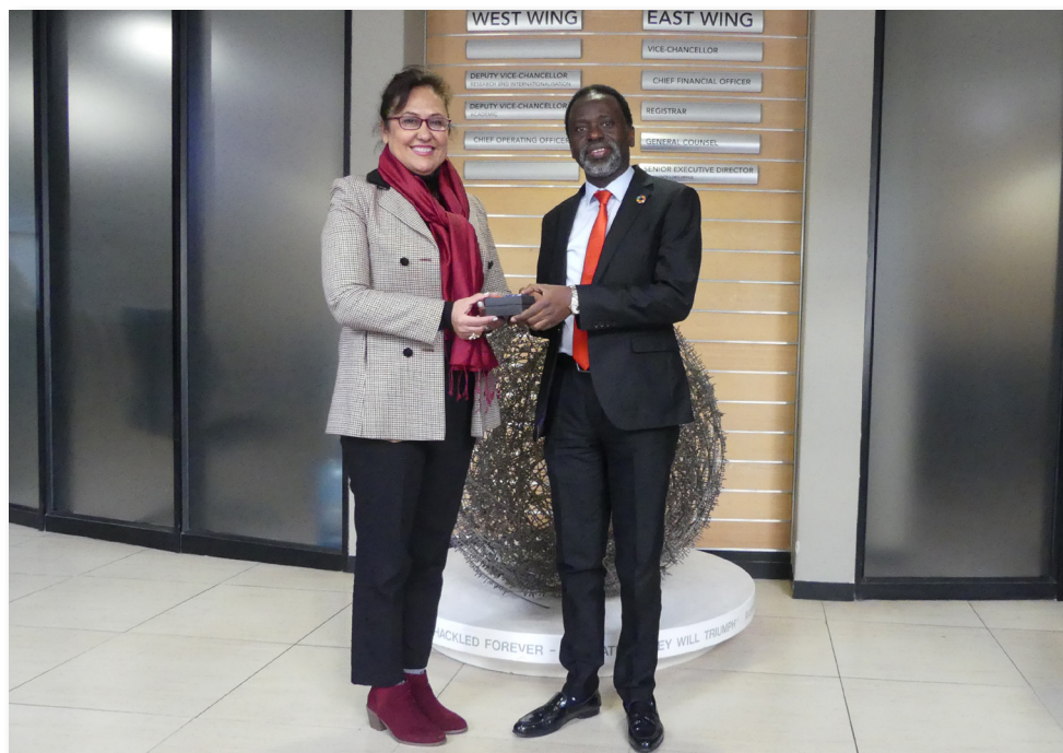
Turkish Ambassador visit