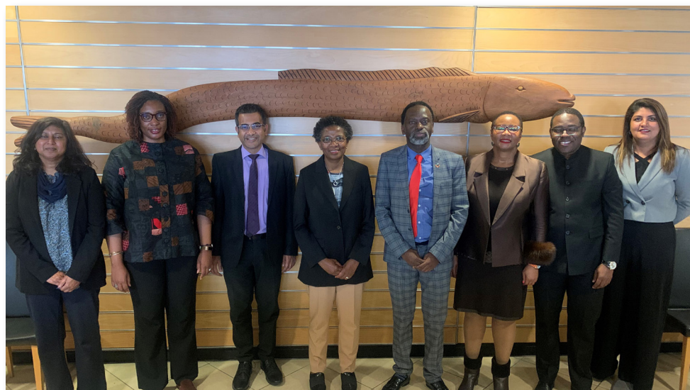
King's College London visit