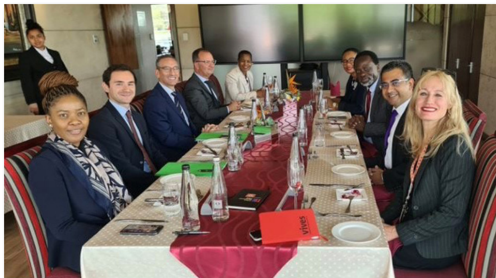
Luncheon with the French Ambassador