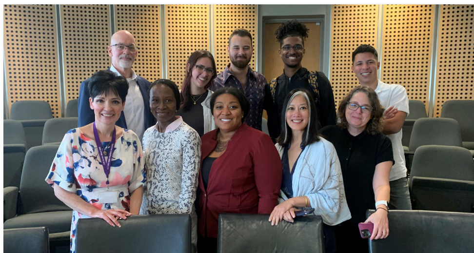
University of Illinois Urbana-Champaign visit