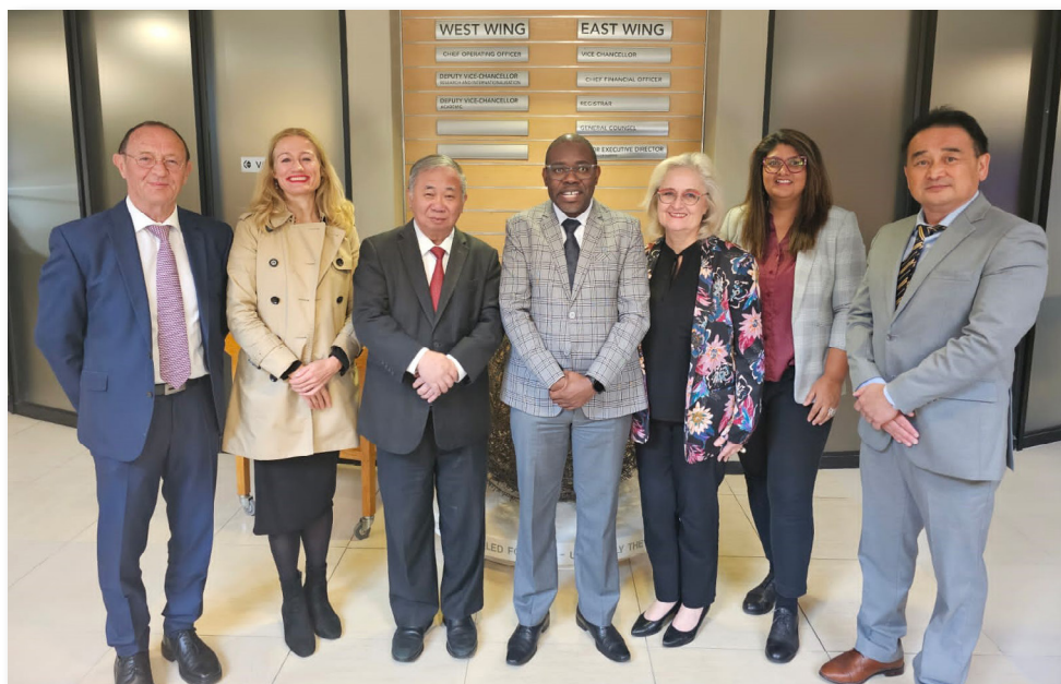
City University of Hong Kong visit