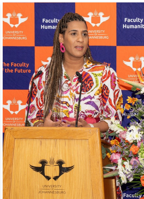
Anielle de Franco, Brazilian Minister for Racial Equality lecture at UJ