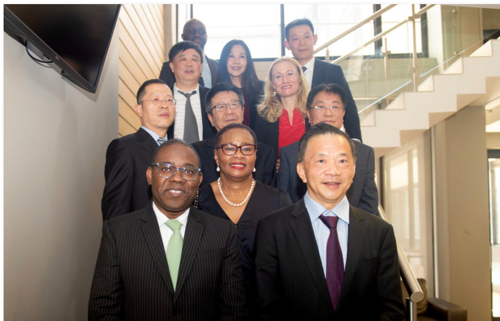
Mr Shen Haixiong, Vice Minister of Publicity Department of CPC Central Committee and President & Editor-in-Chief of China Media Group (CMG) visit to UJ