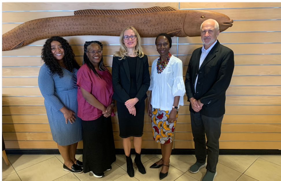
University of Illinois Urbana-Champaign visit