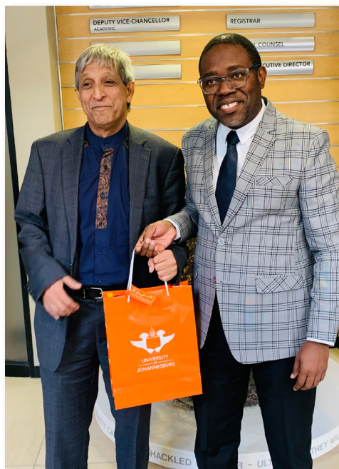
SOAS University of London visit