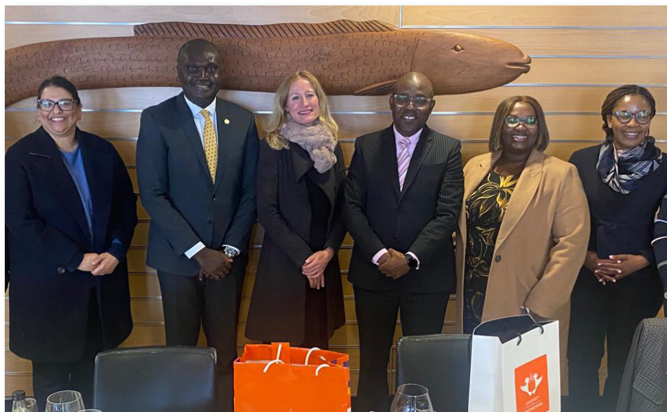
Ghanaian High Commissioner Lunch meeting