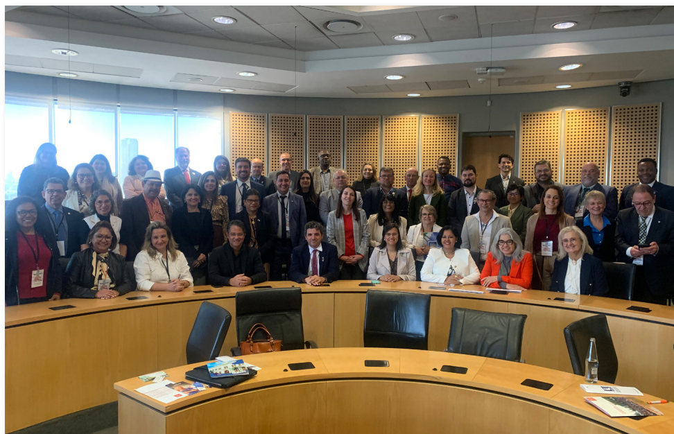
Brazilian Association of Rectors of State and Municipal Universities (ABRUEM)