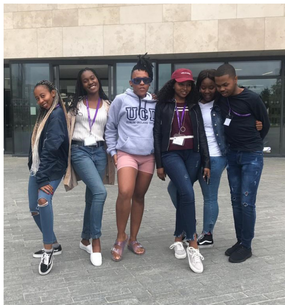
A group of UJ students attended the Bord na Gaeilge UCD Summer School in Dublin, Ireland from the 01st to 05th July. The Summer School focused on the Irish Language and Irish Culture.