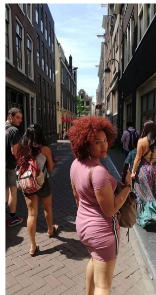
A group of UJ students attended the Summer Institute on Sexuality UvA Summer Programme which took place in Amsterdam from the 16th June to 4th July.