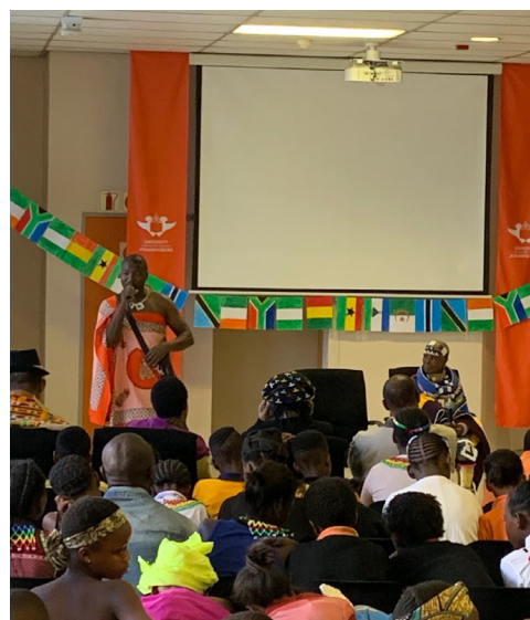
The Division for Internationalisation in partnership with the Department of Childhood Education, Faculty of Education hosted Africa Day at Soweto campus on the 24th May. The theme of the event was "Cultural Heritage and Cultural Economy in the 4th Industrial Revolution". The Guest speaker for the day was Dr. Esther Mahlangu.