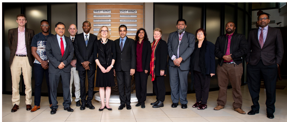
A senior delegation from the University of Cincinnati visited UJ on the 15th May and met with the DVC : Research and Internationalisation and senior UJ colleagues. The aim of the meeting was to discuss potential areas for collaboration.