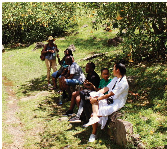
In March 2018 a second group of 18 students from the Graduate School of Architecture embarked on an international field trip to the island of Réunion