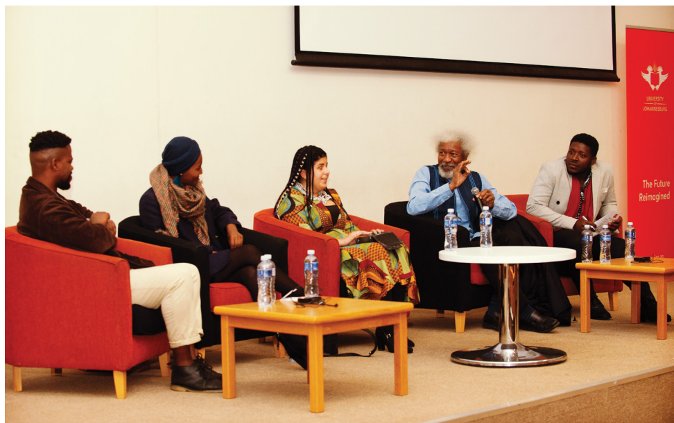
The University of Johannesburg hosted Prof Wole Soyinka at the Funda UJabule Lecture Hall, Soweto Campus on the 18th May. Prof Soyinka delivered his follow up talk also titled "A Long walk to Mandeland" . Prof Soyinka's inaugural public lecture took place at UJ in September 2017.