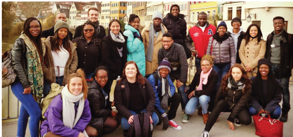
4 UJ students were part of a group of students that participated in the Tubingen – South Africa programme in Germany