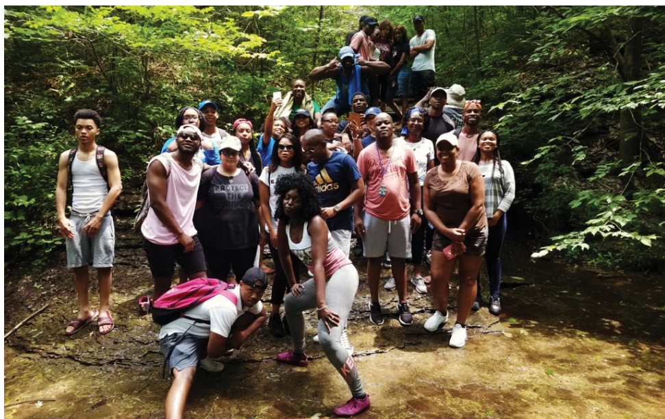
A group of 12 UJ students accompanied by 2 UJ staff members visited Tennessee State University, USA from the 20th June to 02nd July on a Study Abroad programme which included academic and cultural activities.