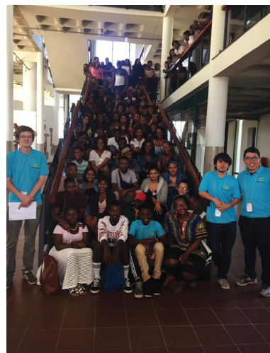
Our first group of UJ students participating in the Africa by Bus programme departed to Mozambique on the 15th June and returned on the 19th June