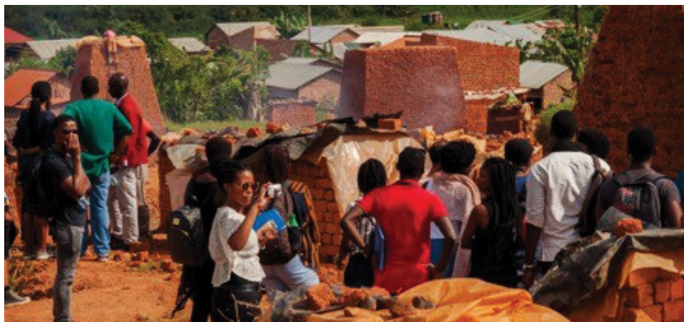
In March 2018, a group of 15 UJ students from the Graduate School of Architecture embarked on an international field trip to Kampala - Uganda