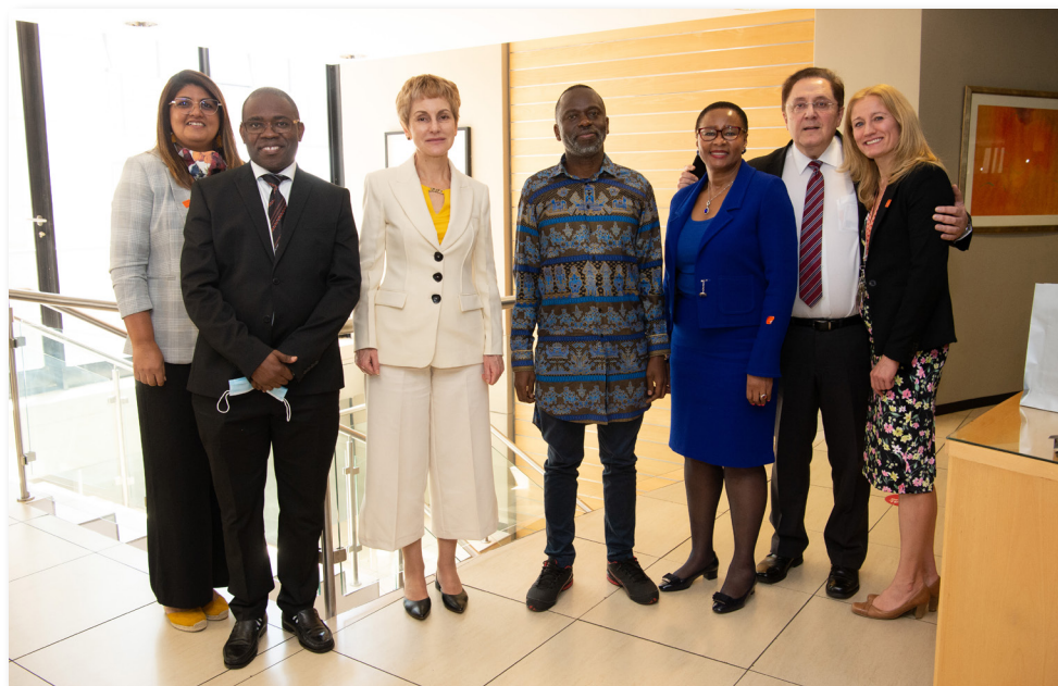
Meeting with the Ambassador of Bulgaria