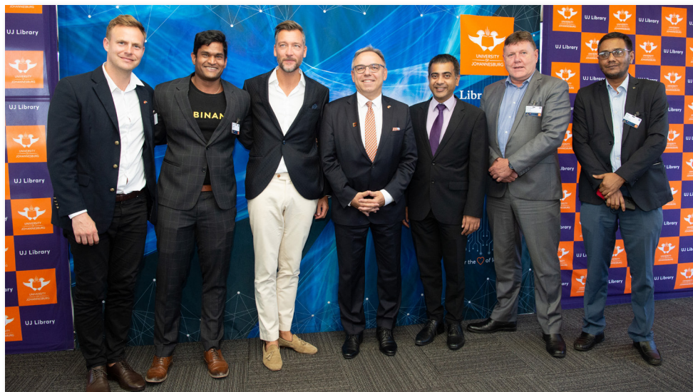
Co-hosted the launch of Crypto Valley Venture Capital Africa (CV VC) with The Institute for Intelligent System (IIS) at UJ