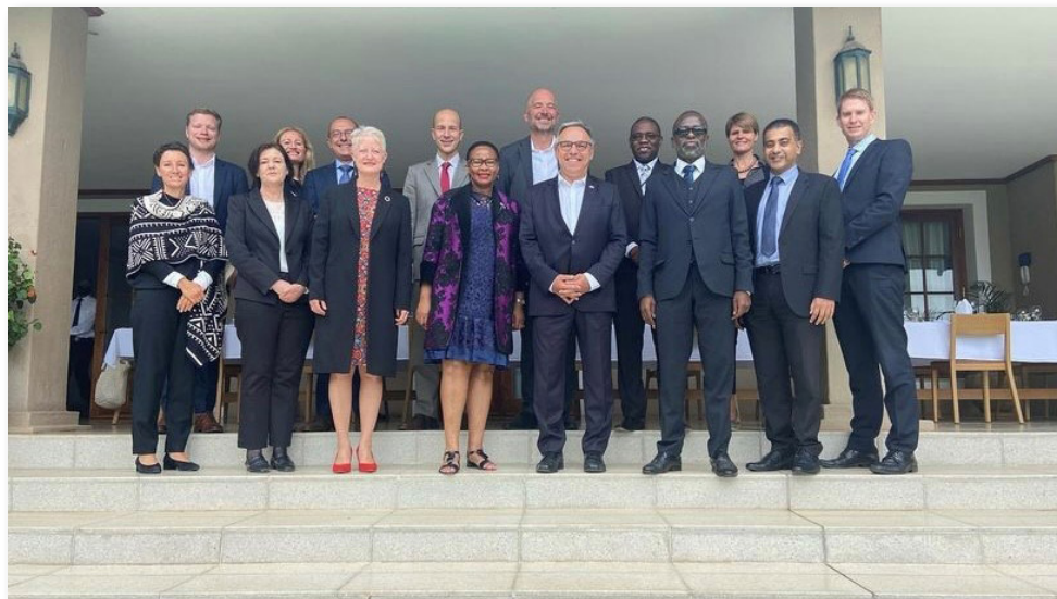
Engagement with Ambassadors at the residence of the Ambassador of Switzerland

Partnered with The Institute of International Education's Scholar Rescue Fund (IIE-SRF) as well as and the New University in Exile, New School. The aim of the collaboration is to provide support to endangered scholars within the network by hosting a scholar. Both organisations have committed to fund a scholar for a year and will contribute $25 000 each. CBE has committed to host one scholar in 2022.