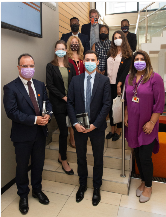
Meeting with delegation from the Embassy of France