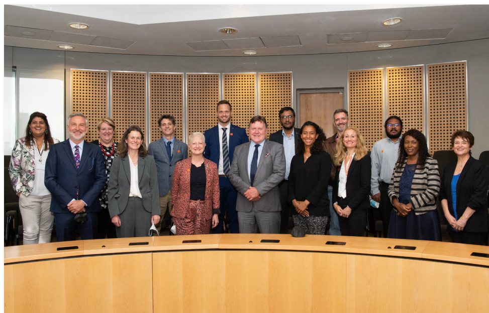
Meeting with EU Delegation