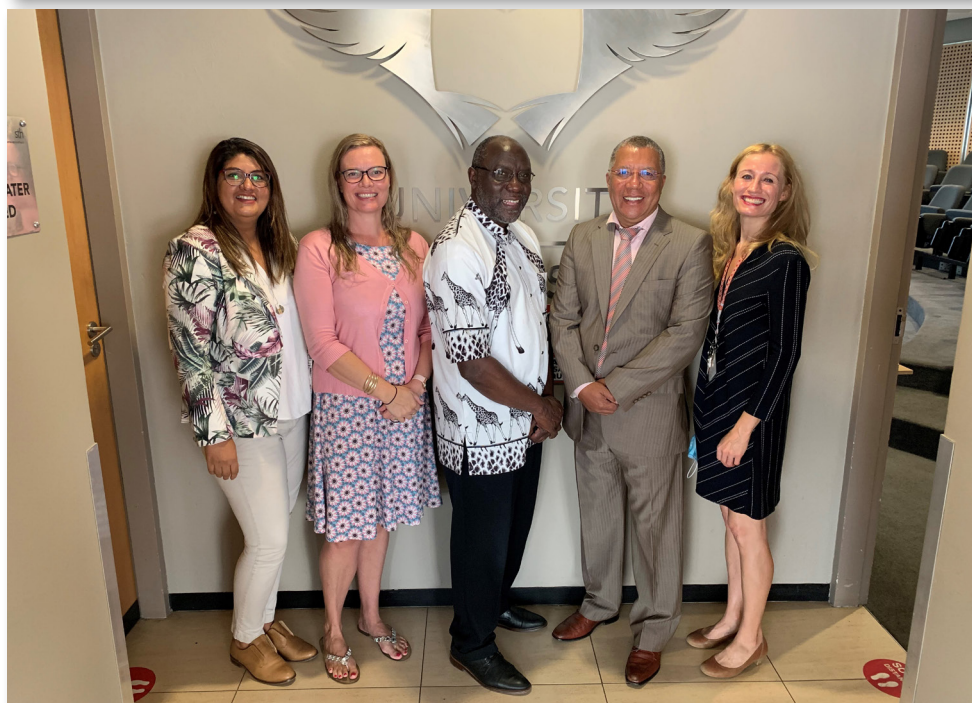
Appalachian State University, USA