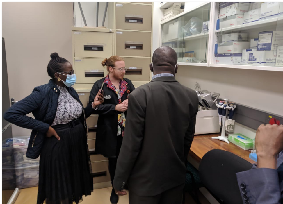
BUAN (Botswana University of Agriculture and Natural Resources)