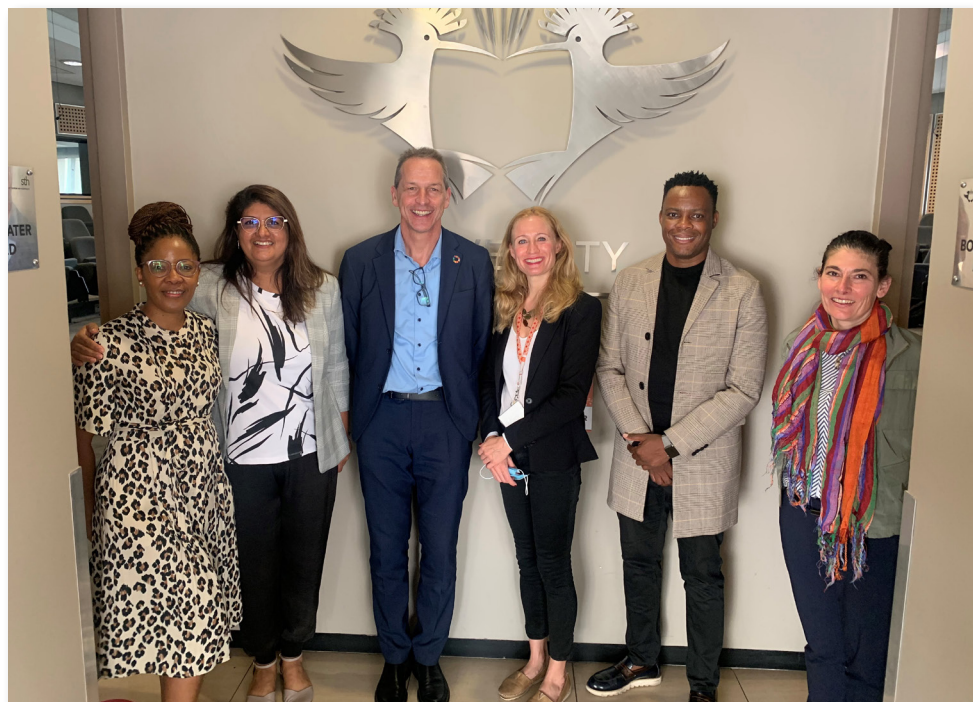
Vrije Universiteit Amsterdam, Netherlands