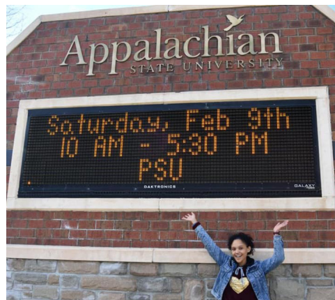
4 UJ students are currently visiting Appalachian State University as exchange students. The students will spend a semester at App. State from 6th January until the 8th May 2019.