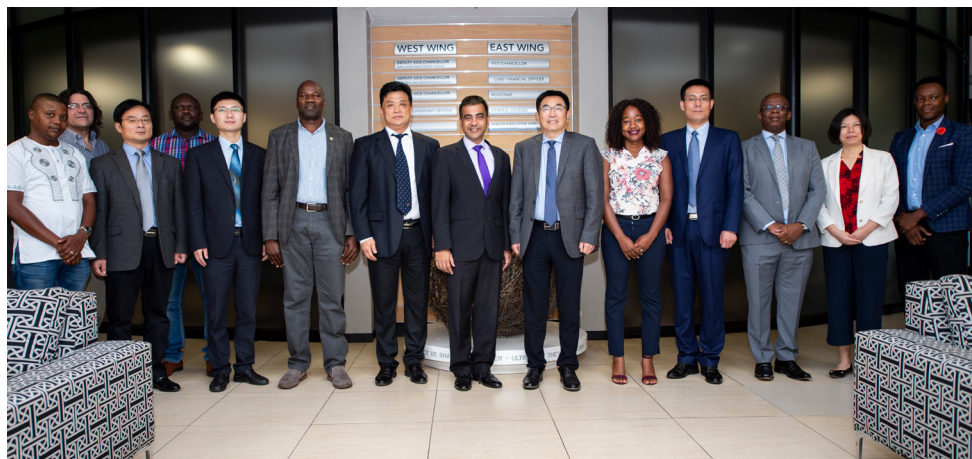
A senior delegation from Xuzhou University of Technology, China visited UJ on the 25 January and met with the DVC : Research and Internationalisation and senior UJ colleagues. The aim of the meeting was to discuss collaboration with a particular focus on student mobility at both the undergraduate and postgraduate level, short term Chinese Culture and Language programmes at XUT.