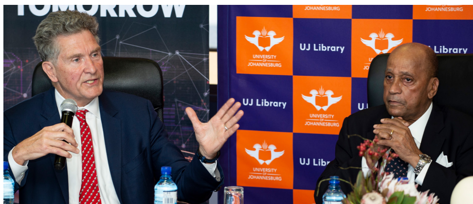
The University of Johannesburg hosted a Colloquium titled “25 Years After Apartheid: An Examination of the Republic of South Africa from the Past and Future Role of Americans” in honour of Ambassador Andrew J. Young. The Colloquium took place on the 20th March at the APK Library.