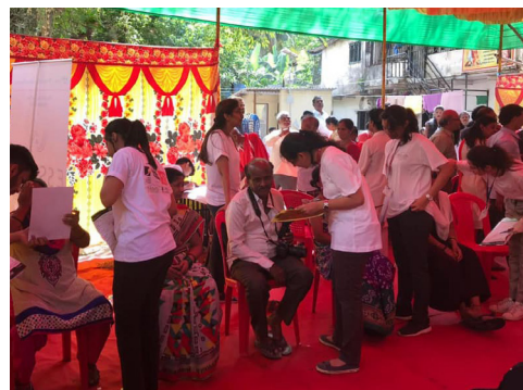
3 UJ students visited India to attend an Optometry Workshop. The students were in India from the 1st to 7th March 2019.