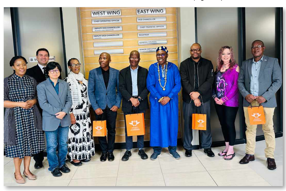
Botswana University of Agriculture and Natural Resources (BUAN) visit