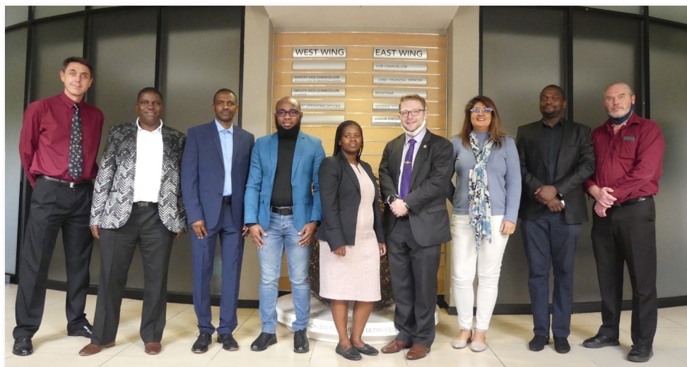
US Department of Defense Office of Naval Research Global (ONRG)