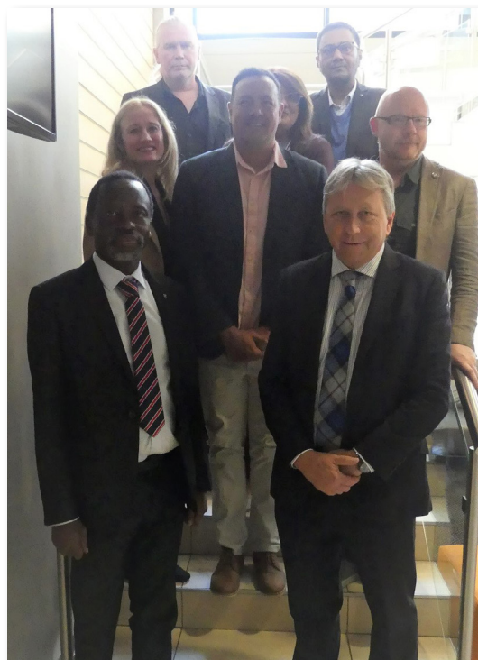
University of Edinburgh visit