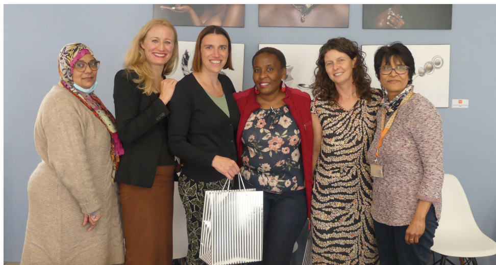
VIVES University of Applied Sciences, Belgium visit