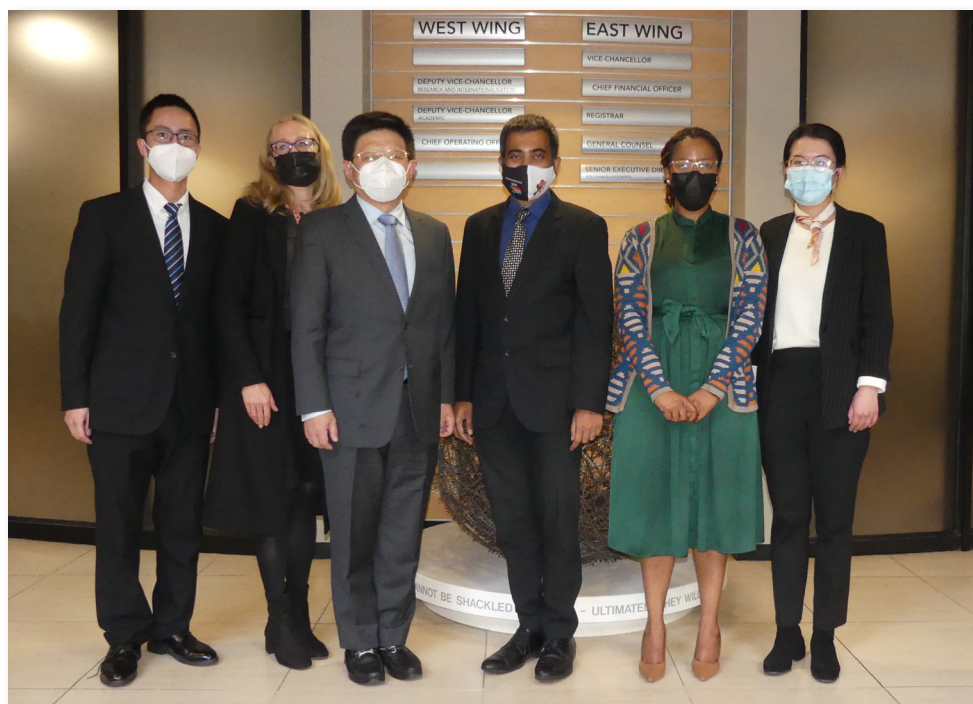
Chinese Consul General visit