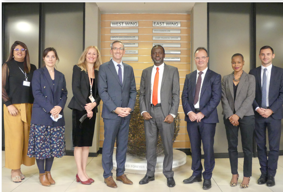
Ambassador of France visit

DISCLAIMER: All events taking place in this venue may be photographed and video recorded for marketing, social media and media purposes. By attending this event, you grant the University of Johannesburg permission to use and publish any recorded material.