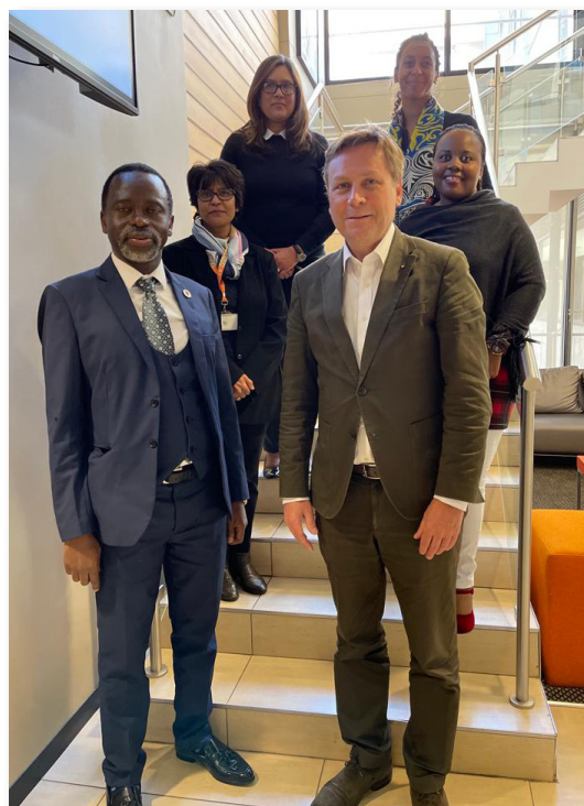
University of Potsdam, Germany visit