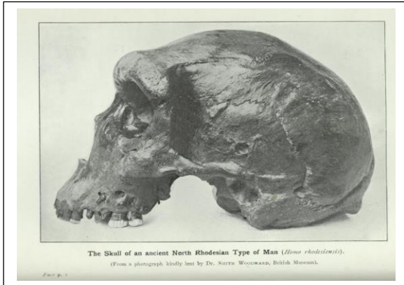
Ancient skull of Homorhodesiens