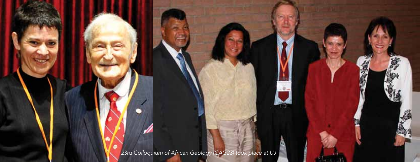
23rd Colloquium of African Geology (CAG23) took place at UJ