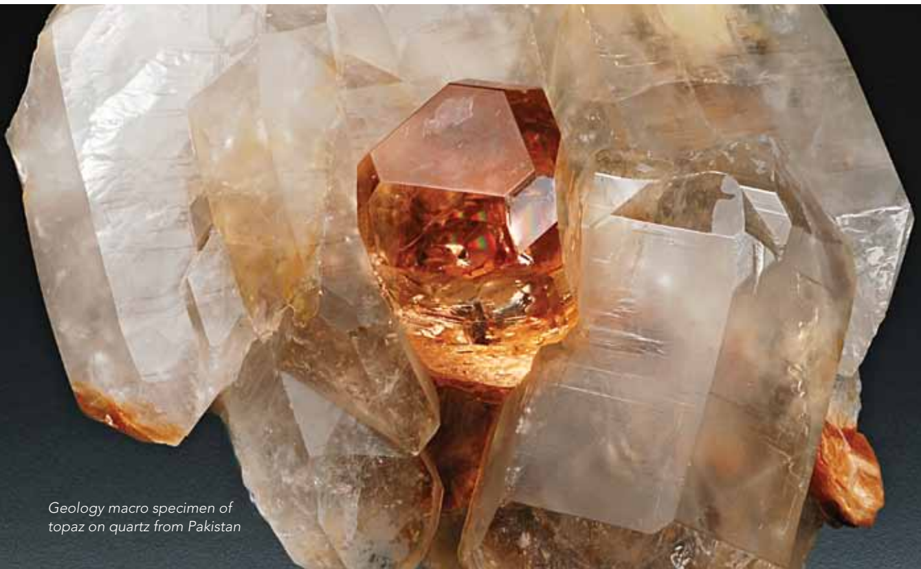
Geology macro specimen of topaz on quartz from Pakistan