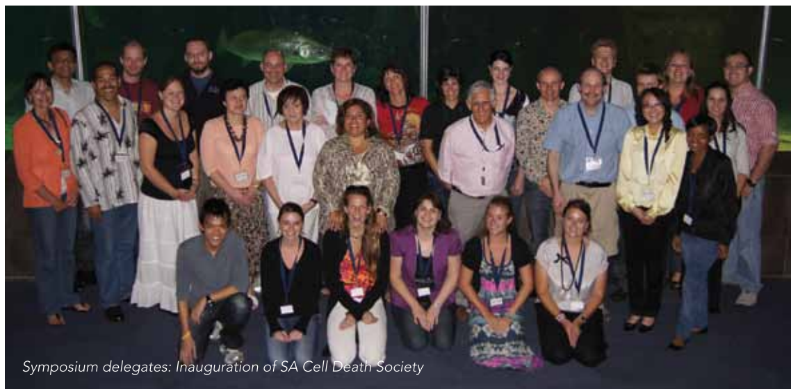
Symposium delegates: Inauguration of SA Cell Death Society