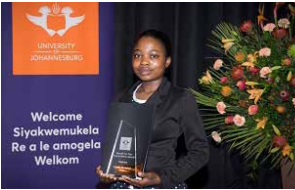
UJ First Year Top Achiever in a Diploma-programme